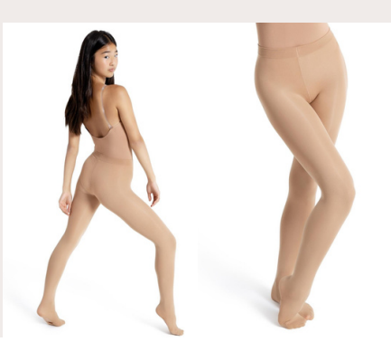
ADULT FLESH TIGHTS