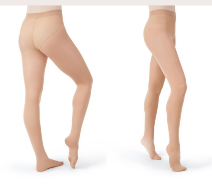
CHILD FLESH TIGHTS