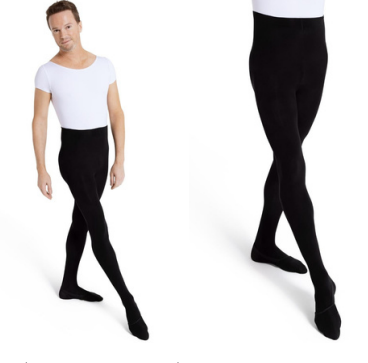
ADULT BLACK TIGHTS