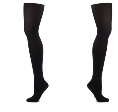
CHILD BLACK TIGHTS